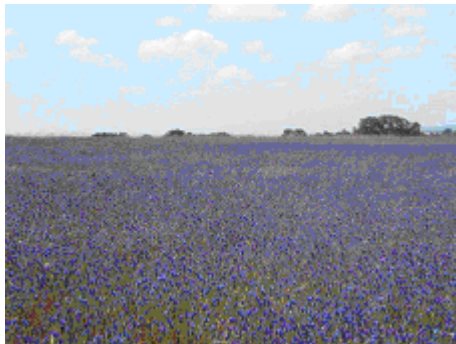
Figure 2: Paterson's curse during flowering period.

Finding remote sensing data with suitable spectral, spatial, temporal resolutions and developing optimal digital image processing techniques is one of the challenges set in this research.