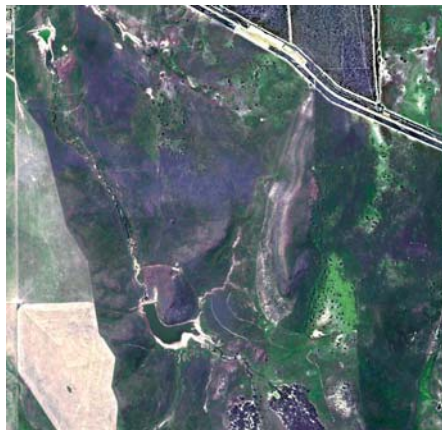
Figure 4: A natural colour composite of DMSI (bands 3,2,1) showing 'violet' colouring of a heavy infestation of Paterson's curse. Infestations of this magnitude are unusual in farms with good management practices.

Paterson's curse ( Echium plantagineum L.), an annual/biennial herbaceous weed common in agricultural areas of Western Australia, presents a good example where success in weed mapping appears driven by the sensor's spectral resolution and time of data acquisition. This weed presents a very distinctive violet flowers during spring (e.g. September to December), KTRI (1998). We used this special phenological attribute to map its distribution in pastures, using 2-m resolution digital multispectral images (DMSI), and hyperspectral Hyperion imagery. The DMSI remote sensing imagery and field data collected concurrently were analyzed using statistical regression techniques.