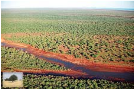
Figure 1: Aerial view of mesquite infestation.